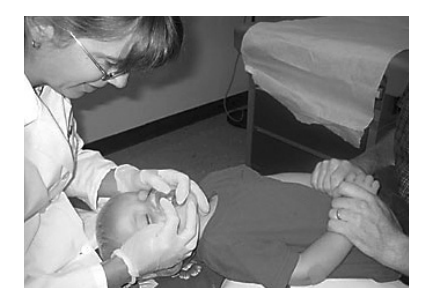
Figure 1. Position of the child for conducting clinical evaluation

The American Academy of Pediatrics has provided guidelines for conducting clinical evaluation of children (20). A dental chair is not needed to perform an oral examination. For infants and children younger than three years, place the child in the parent's lap facing the parent. The provider and parent should sit face to face with knees touching. The child should then lie back (with the child's legs around the parent's waist) laying his or her head in the provider's lap with the head nestled in the provider's abdomen (Figure 1). An alternative position is to have the parent nestle the child in the parent's arm, while the provider examines the child's mouth. By age three years, children are able to lie on