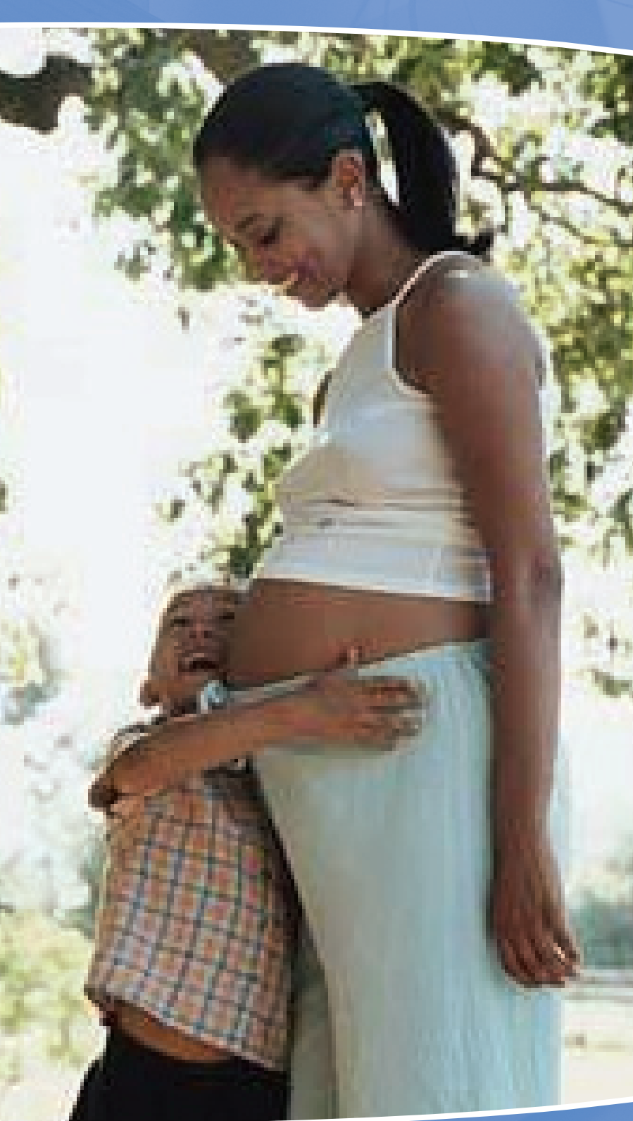
New York State Department of Health August 2006